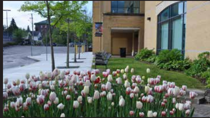
Tulips donated by Gloria Reszler to celebrate Canada 150